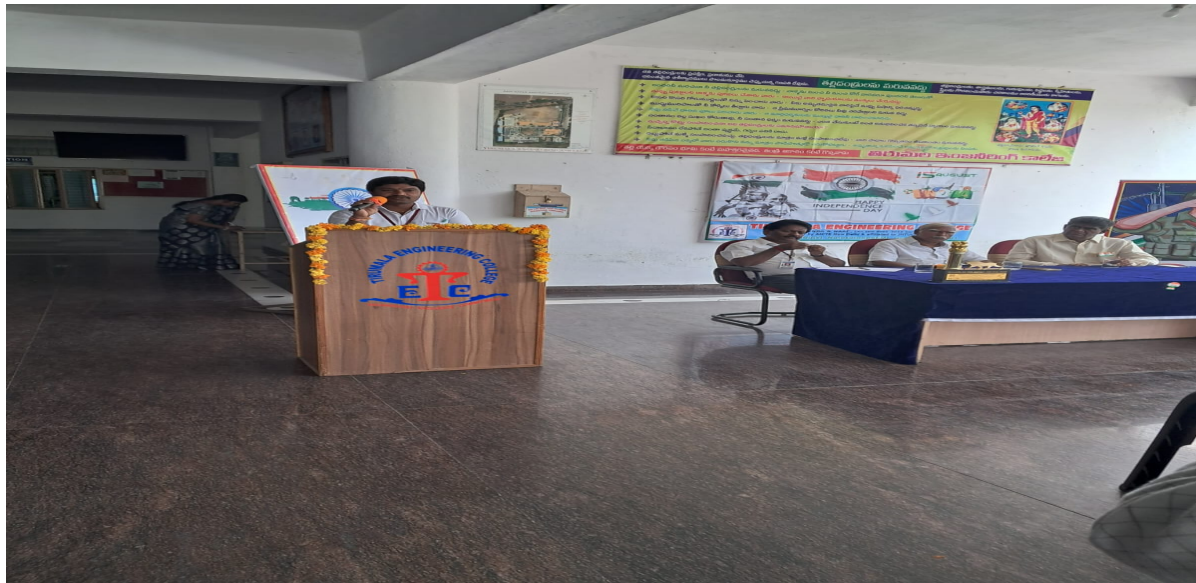
HOD ECE addressing the gathering students and staff