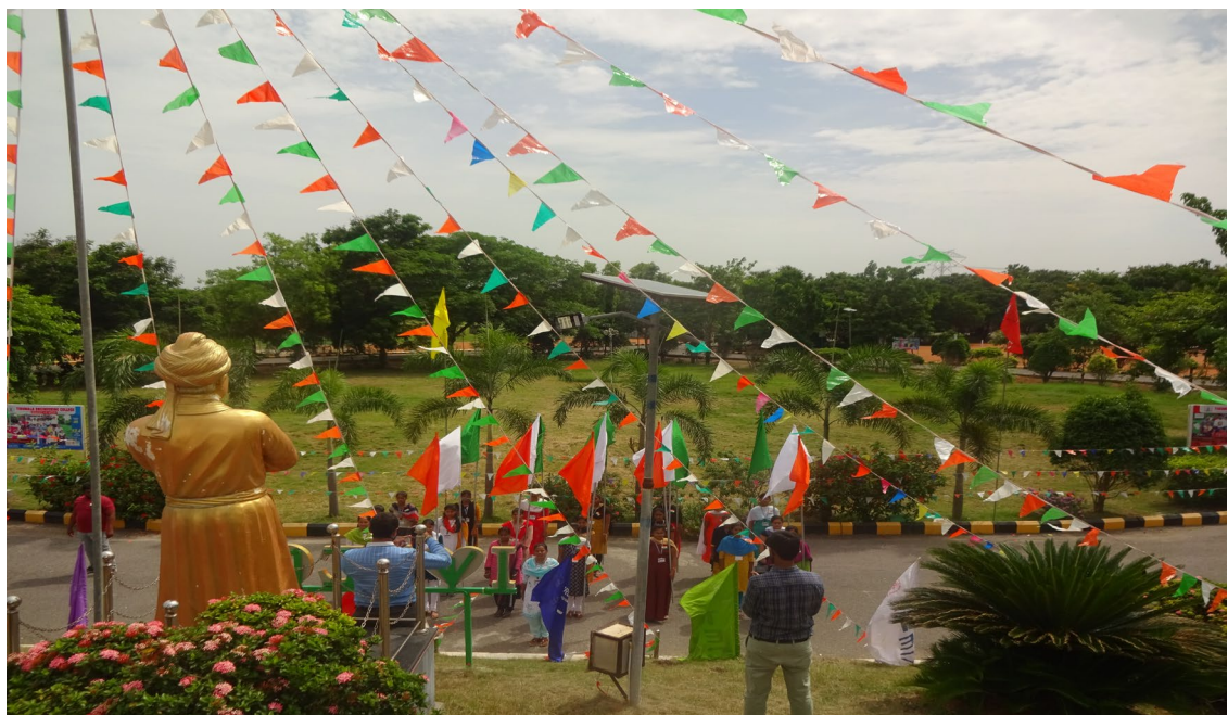
Students participating in marchfest with National Flags