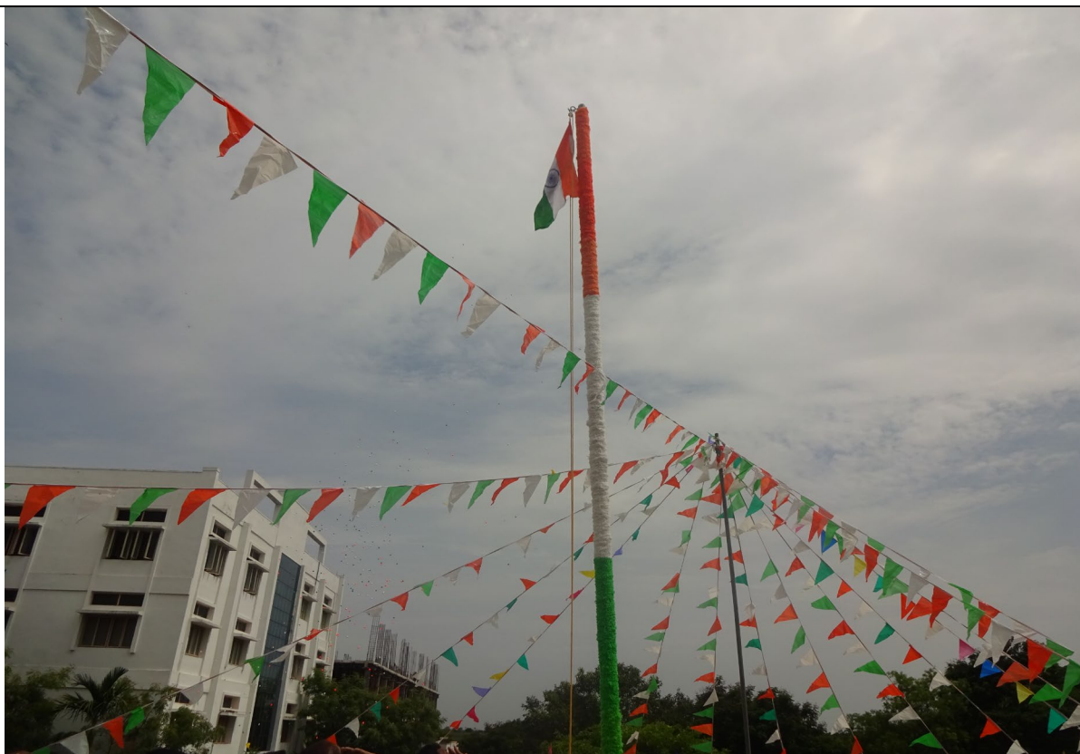
National flag hoisted by principal sir and Management