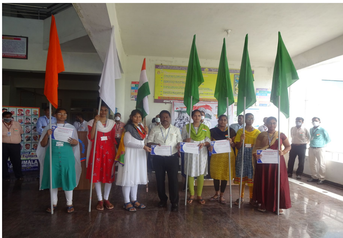
Principal sir with NSS Volunteers