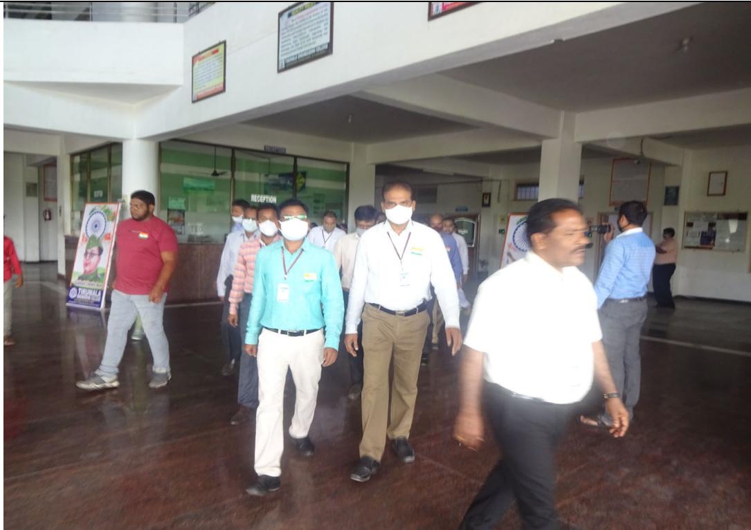
HODs and Principal is moving for Flag Hoisting